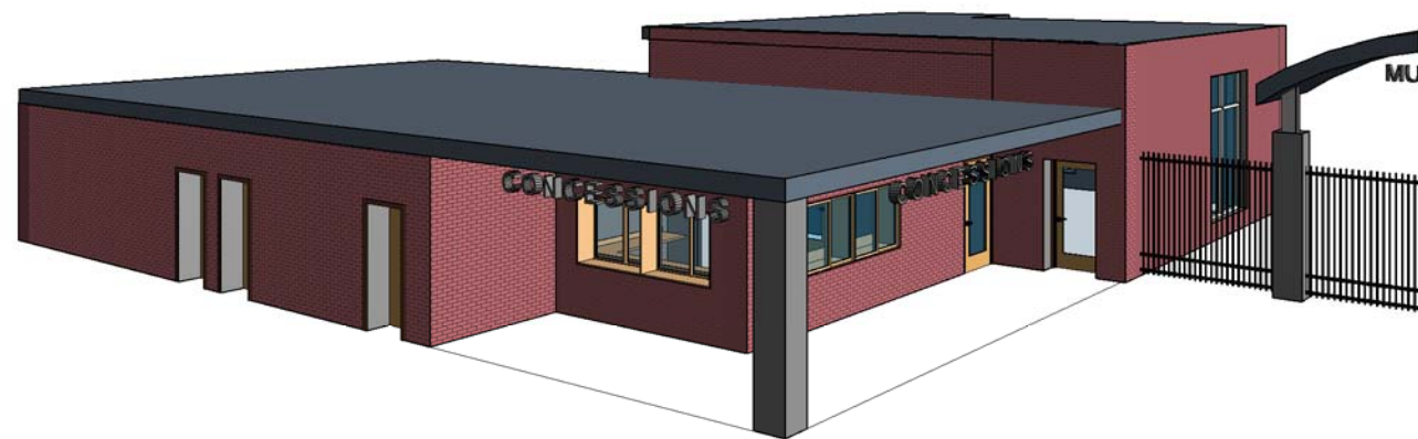
① View toward concessions and toilets